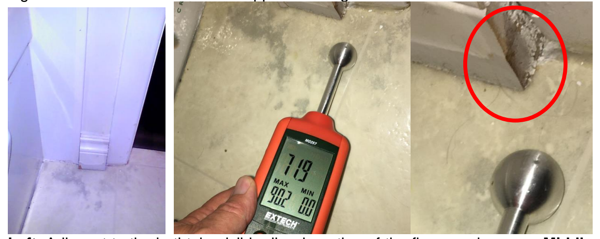
Left. Adjacent to the bathtub, visible discolouration of the floor can be seen. Middle. A moisture measurement shows high moisture content in the floor (72% moisture content). Right. A magnified image shows that the baseboard is visible wet.

An inspection of the bathroom was performed using a moisture meter and an infrared camera. Both the wall/floor beside the bathtub and the bottom of the vanity cabinet had high moisture content that would support mould growth.